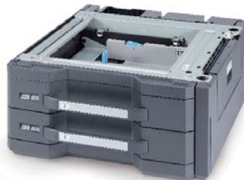
1000-SHEET PAPER FEEDER PF-730 Ideal for paper sizes between A5 and "12x18" (305x457)