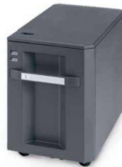
3000-SHEET PAPER FEEDER PF-770 Ideal for large A4 print runs.